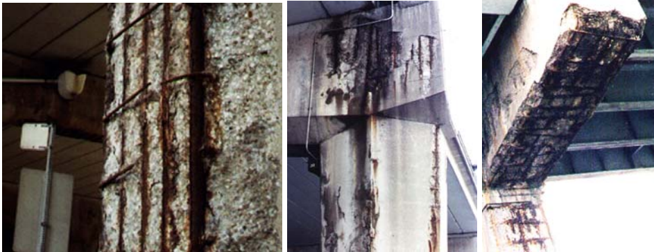
Typical corrosion of bridges and overpasses.

In recent years, rebar corrosion has proven to be a serious issue in many projects, particularly in infrastructure, such as bridges and highway overpasses. Just the issue of Highway overpasses is costing Billions of Dollars per year in maintenance, repair and replacement.