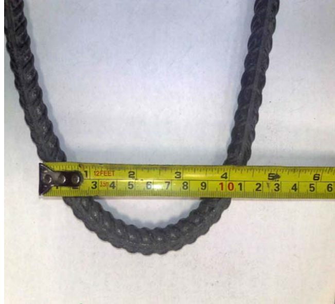
Bent rebar, coated with ArmorGalv® - No flaking or peeling.